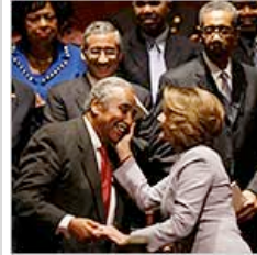
Congressional Black Caucus Assesses Its Role