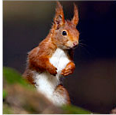
Saving a Squirrel by Eating One