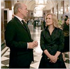
Suspenseful Corporate Litigation Returns