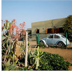
In Egypt, Living on a Farm