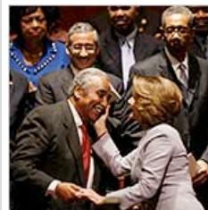
Congressional Black Caucus Assesses Its Role