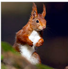
Saving a Squirrel by Eating One