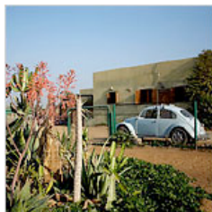
In Egypt, Living on a Farm