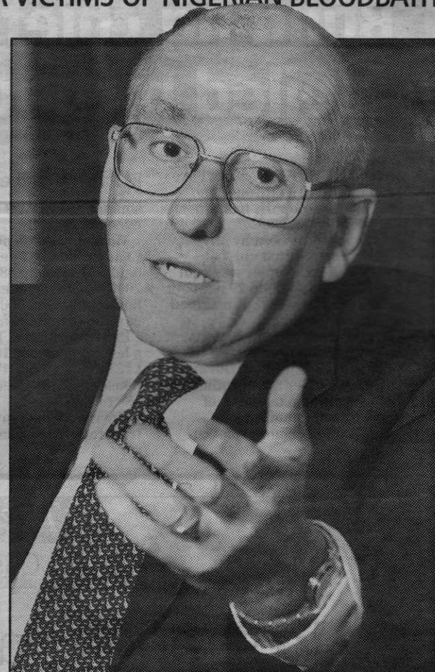
Under fire: Sir Philip Watts ran Shell's Nigerian SDPC subsidiary. Left, armed police in action in the oil centre of Port Harcourt

It emerged last week that Shell's management was warned by its own planners four years ago about future production levels. UK and US regulators are investigating whether shareholders should have been told sooner.