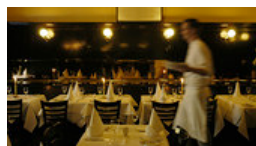
Busboys Are Cut as Restaurants Suffer