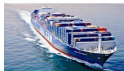
New Generation of Ocean Behemoths