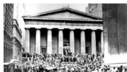
Central Banks Are Creatures of Financial Crises