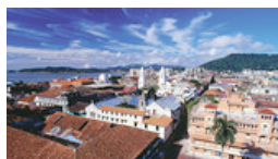
Off the Beaten Track: Panama City