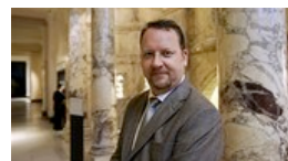
Book Lover: Revisiting the Recent Past