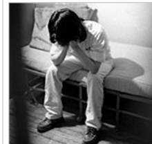
A Caged Man Breaks Out at Last