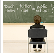
Wary Parents Weigh Public and Private School