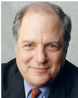
Frank Rich