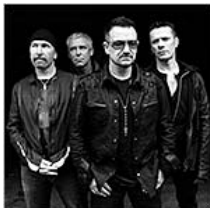
U2: Last Gang in Town